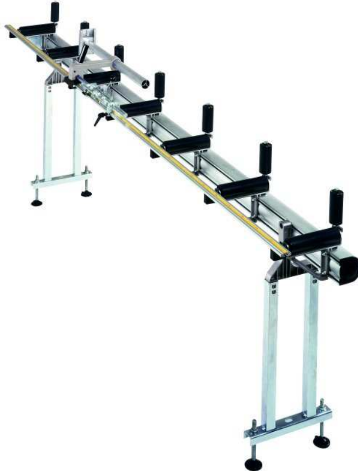
Roller table with manual length stop positioning